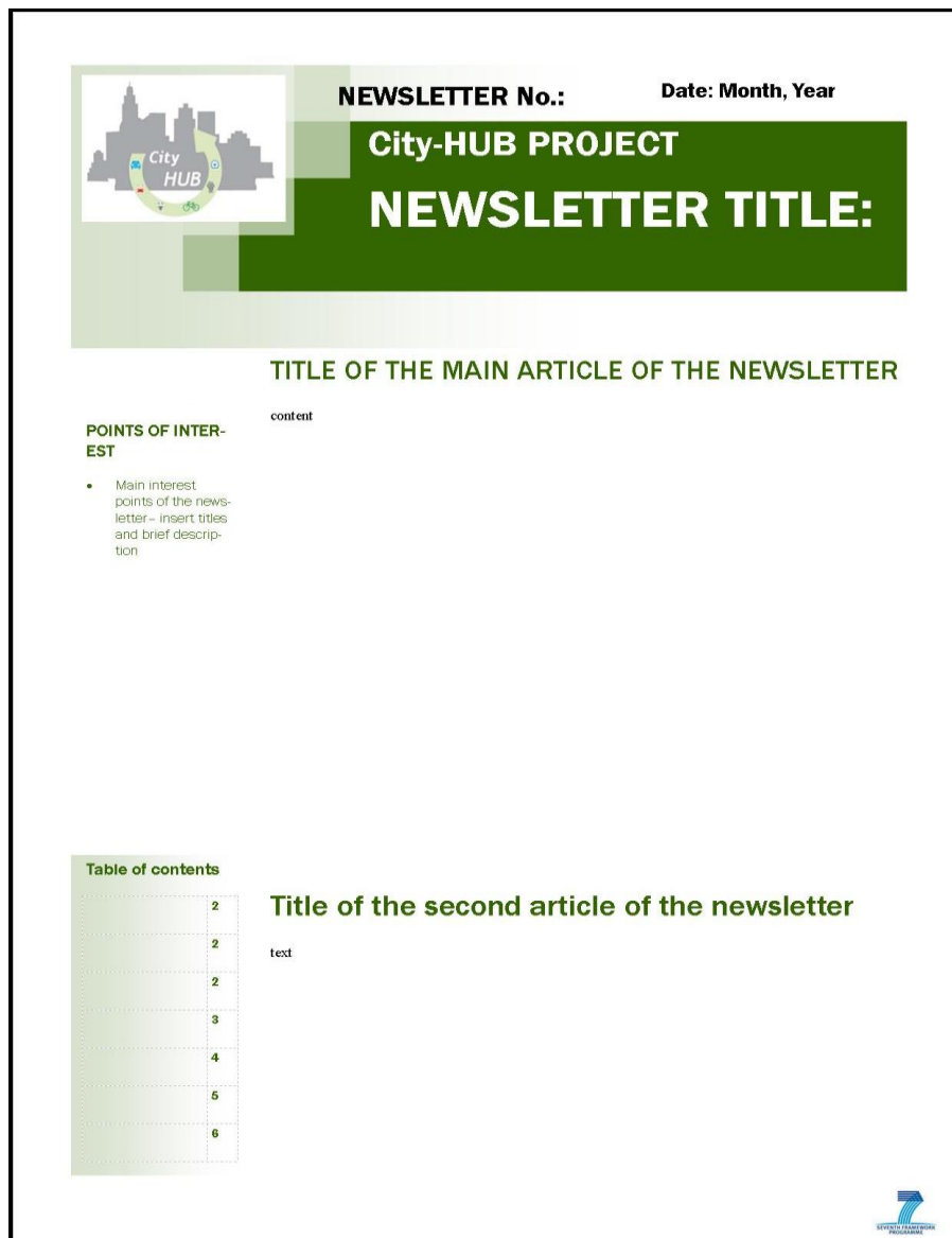
Figure 4: Newsletter template

A draft template for the newsletter has been prepared (Figure 4), and all partners will be asked to collaborate in the preparation of the newsletters, giving their feedback as each WP progresses.